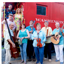
Shenandoah Run Oct 9