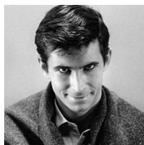
Scary-Tale Endings: Halloween Movie Week Oct 25 -29