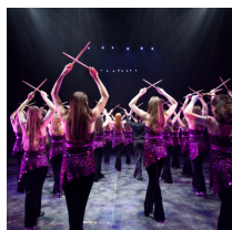
Teelin Irish Dance Company Sep 18